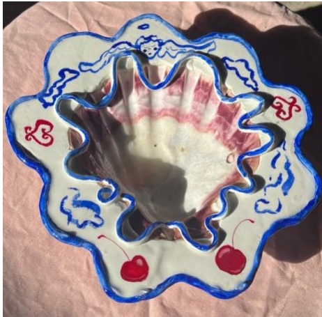
Chell-Fish Cherry Shell Bowl, 2023 Real shells, held together by an epoxy clay, gouache paint and a food safe art resin. 9 inches round