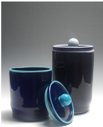
Jessi Moore Tall Blue Cookie Jar, 2023 Hand Blown Glass