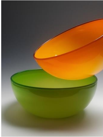
Jessi Moore Orange Fruit Bowl, 2023 Hand Blown Glass 5.5 high x 11 wide inches