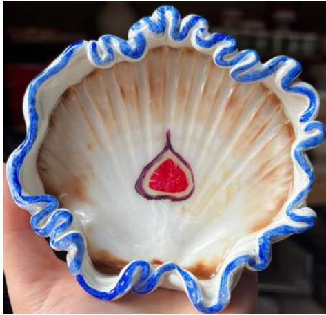
Chell-Fish Fig Scallop Dish , 2023 Real shells, held together by an epoxy clay, gouache paint and a food safe art resin. approx. 5 inches round