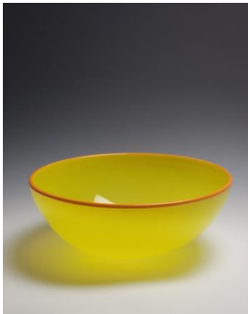
Jessi Moore Yellow Fruit Bowl, 2023 Hand Blown Glass 5.5 high x 11 wide inches