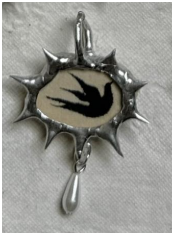
Laura Benson Sparrow Pendant 2 , 2023 Lead-free solder, glass, paint on found paper