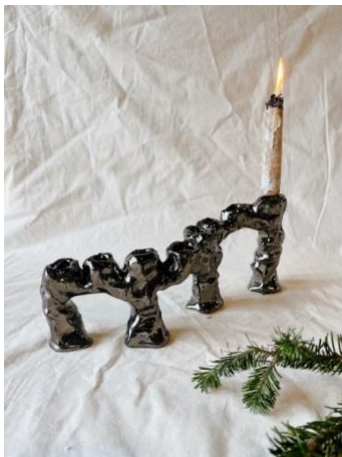
Fernanda Uribe Nera Candelabra, 2023 Hand sculpted Ceramic stoneware 12 x 4 x 5"