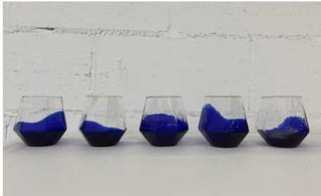
Jessi Moore (5) Dark Blue Rock Candy Glasses, 2023 Hand Blown Glass