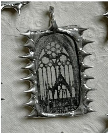
Laura Benson Cathedral Pendant, 2023 Lead-free solder, glass, found imagery