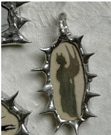
Laura Benson Shadow Guide Pendant, 2023 Lead-free solder, glass, paint on found paper