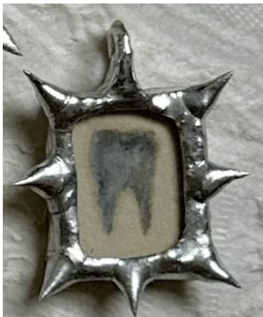
Laura Benson Toothache Pendant 1 , 2023 Lead-free solder, glass, paint on found paper