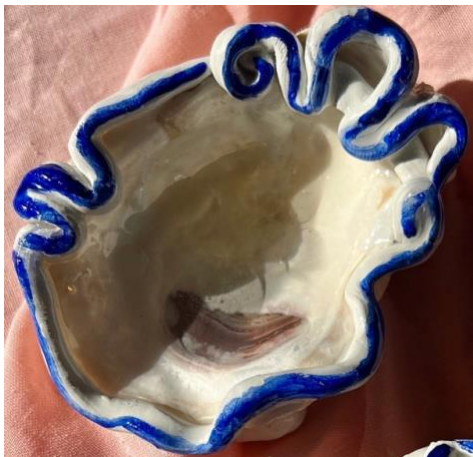
Chell-Fish Salt Holder 2 , 2023 Real shells, held together by an epoxy clay, gouache paint and a food safe art resin. approx. 3 inches round