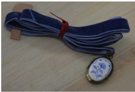
Dear Dolly Locket 2, 2023 Watercolors, Epoxy clay, Metal, Velvet ribbon