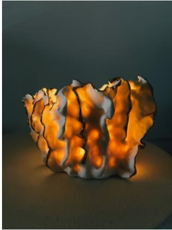
Fernanda Uribe Concha Marina, Candle Holder, 2023 Hand sculpted porcelain with 18 Karat Gold 5 x 5 x 4 inches