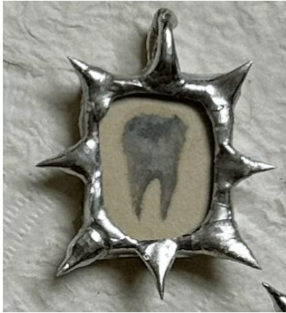
Laura Benson Toothache Pendant 2, 2023 Lead-free solder, glass, paint on found paper