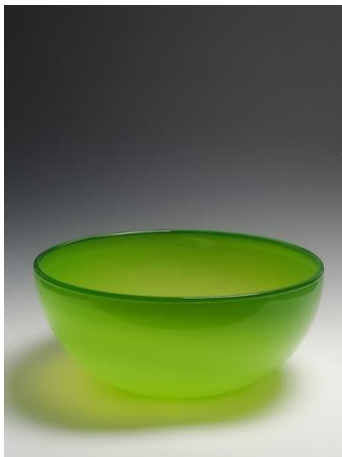
Jessi Moore Green Fruit Bowl, 2023 Hand Blown Glass 5.5 high x 11 wide inches