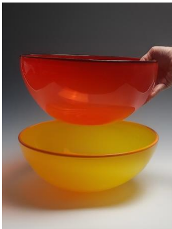
Jessi Moore Red Fruit Bowl, 2023 Hand Blown Glass 5.5 high x 11 wide inches