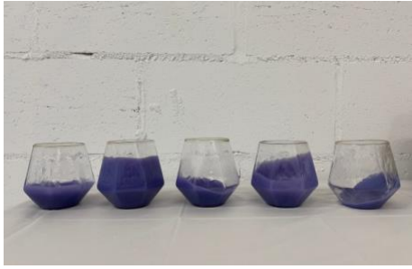
Jessi Moore (5) Purple Rock Candy Glasses, 2023 Hand Blown Glass