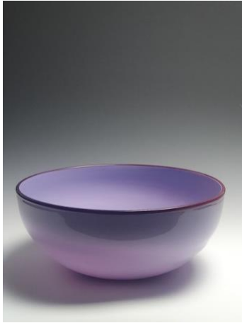
Jessi Moore Purple Fruit Bowl, 2023 Hand Blown Glass 5.5 high x 11 wide inches