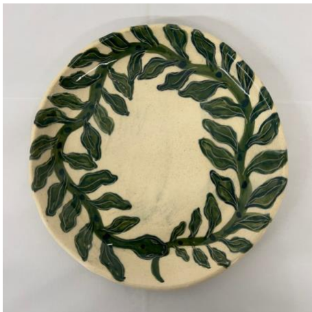
Fernanda Uribe Ouroborus Ivy Snake, 2023 Hand sculpted Ceramic stoneware with Italian pigments 8 inches diameter