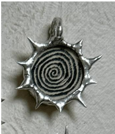
Laura Benson Spiraling Pendant, 2023 Lead-free solder, glass, paint on found paper