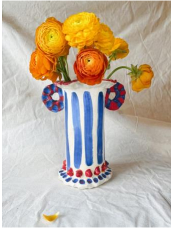
Fernanda Uribe Minerva's Column, 2023 Hand sculpted Ceramic stoneware with Italian pigments 5 x 8 x 9"