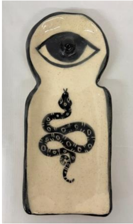
Fernanda Uribe The Rising, Incense Holder, 2023 Hand sculpted Ceramic stoneware with Italian pigments 5 x 5 x 4 inches