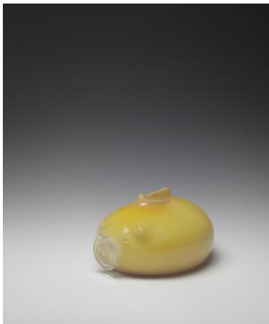
Jessi Moore Piggy Bank, 2023 Hand Blown Glass, transparent gold 3 x 6 inches