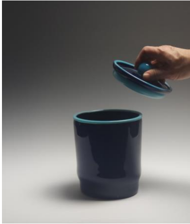
Jessi Moore Blue Cookie Jar, 2023 Hand Blown Glass