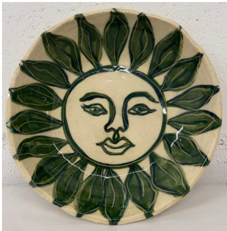
Fernanda Uribe Green Sunflower, 2023 Hand sculpted Ceramic stoneware with Italian pigments 8 inches diameter