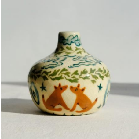
Erin Ibo Dog Bud Vase, 2023 Hand thrown and painted stoneware vase. 3 x 3 3/8 x 3 3/8 in.