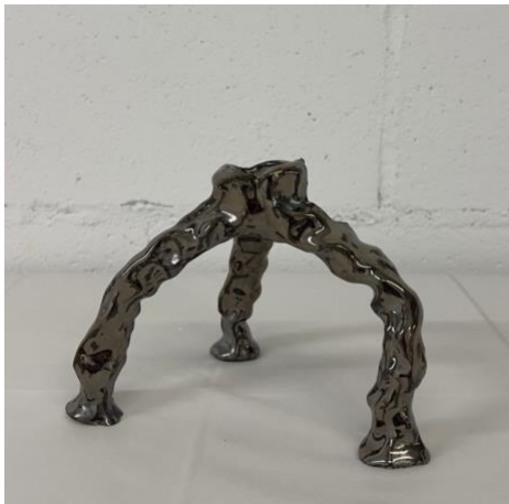
Fernanda Uribe Monsters, Candle Holders, 2023 Hand sculpted ceramic Stoneware with gunmetal glaze 7 x 5 x 5 Inches