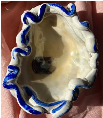
Chell-Fish Salt Holder , 2023 Real shells, held together by an epoxy clay, gouache paint and a food safe art resin. approx. 3 inches round