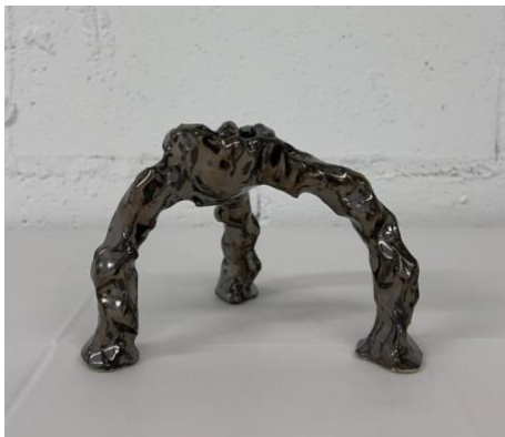
Fernanda Uribe Monsters, Candle Holders, 2023 Hand sculpted ceramic Stoneware with gunmetal glaze 6 x 5 x 4 Inches