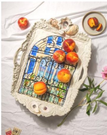
Chell-Fish Courtyard Dream, 2023 Epoxy clay, gouache, oyster shells, wood, resin 22 x 16 x 5.5 inches