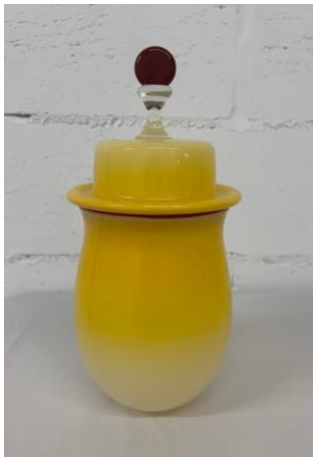
Jessi Moore Yellow Candy Jar, 2023 Hand Blown Glass Varies in size between 7" / 12" high