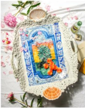
Chell-Fish Luna Rose Bush, 2023 Epoxy clay, gouache, oyster shells, wood, resin 22 x 17 x 6 inches