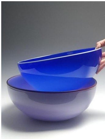
Jessi Moore Blue Fruit Bowl, 2023 Hand Blown Glass 5.5 high x 11 wide inches