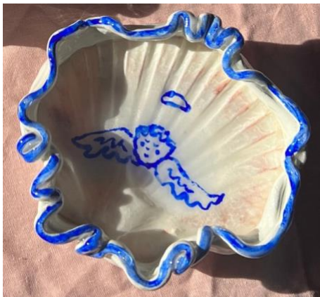
Chell-Fish Angel Scallop Dish, 2023 Real shells, held together by an epoxy clay, gouache paint and a food safe art resin. 5 inches round