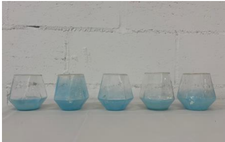
Jessi Moore (5) Light Blue Rock Candy Glasses, 2023 Hand Blown Glass