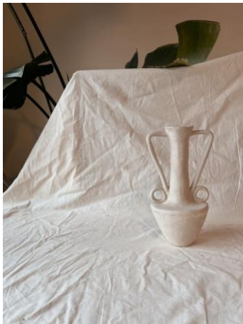
Fernanda Uribe Artemis, Amphora, 2023 Hand sculpted Ceramic stoneware 5.5 x 6 x 11.5 inches