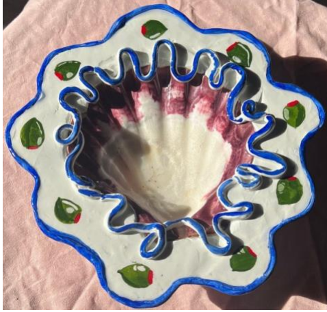
Chell-Fish Olive Shell Bowl, 2023 Real shells, held together by an epoxy clay, gouache paint and a food safe art resin. 9 inches round