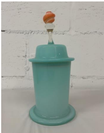
Jessi Moore Blue Candy Jars, 2023 Hand Blown Glass Varies in size between 7" / 12" high