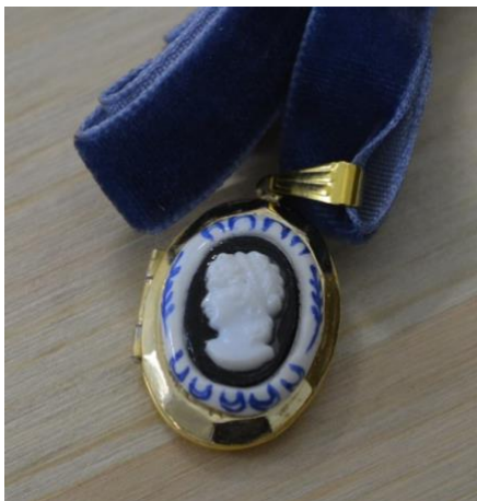
Dear Dolly Locket 8, 2023 Watercolors, Polymer clay, Metal, Velvet ribbon