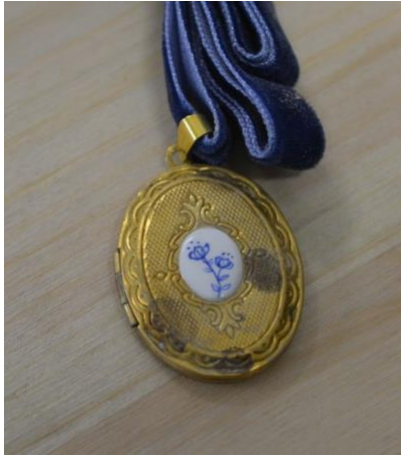
Dear Dolly Locket 1, 2023 Watercolors, Polymer clay, Metal, Velvet ribbon