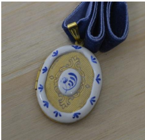
Dear Dolly Locket 12, 2023 Watercolors, Polymer clay, Metal, Velvet ribbon