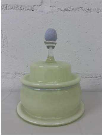
Jessi Moore Light Green Candy Jar, 2023 Hand Blown Glass Varies in size between 7" / 12" high