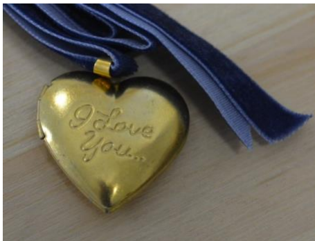
Dear Dolly Locket 6, 2023 Watercolors, Polymer clay, Metal, Velvet ribbon