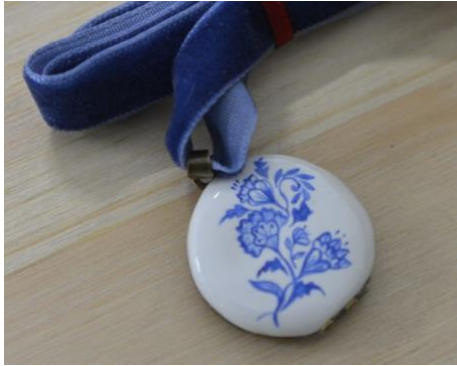
Dear Dolly Locket 11, 2023 Watercolors, Polymer clay, Metal, Velvet ribbon