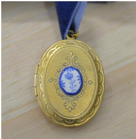
Dear Dolly Locket 7, 2023 Watercolors, Polymer clay, Metal, Velvet ribbon