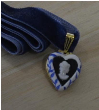
Dear Dolly Locket 5, 2023 Watercolors, Polymer clay, Metal, Velvet ribbon