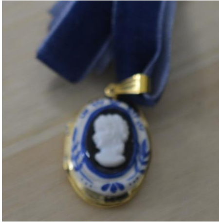
Dear Dolly Locket 9 , 2023 Watercolors, Polymer clay, Metal, Velvet ribbon