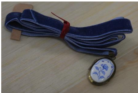
Dear Dolly Locket 2, 2023 Watercolors, Polymer clay, Metal, Velvet ribbon