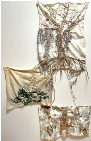
Iviva Olenick Myths of Plants and Women, 2023 Embroidery and crochet on fabrics dyed and printed with purple leaf sandcherry tree leaves, indigo, rose petals; threads dyed with sumac, goldenrod, onion skin, woad seeds 43 x 30 x 2 inches.