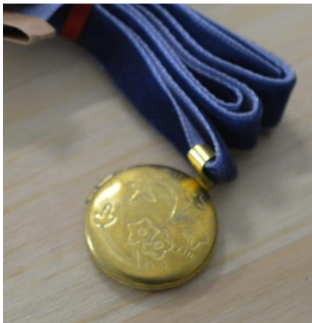
Dear Dolly Locket 10, 2023 Watercolors, Polymer clay, Metal, Velvet ribbon