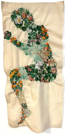
Iviva Olenick #fetalposition, 2023 Embroidery, beading, appliqué, plant dyes on fabric and thread. 40 x 21 inches