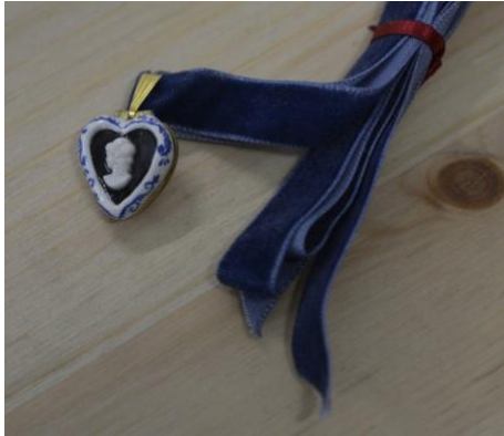
Dear Dolly Locket 3, 2023 Watercolors, Polymer clay, Metal, Velvet ribbon