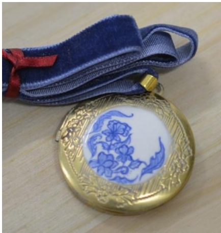
Dear Dolly Locket 4, 2023 Watercolors, Polymer clay, Metal, Velvet ribbon