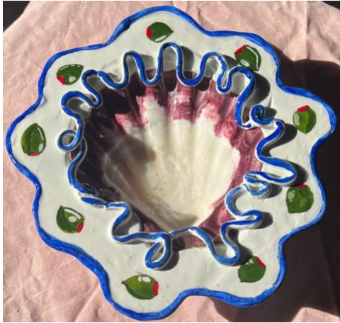
Chell-Fish Olive Shell Bowl, 2023 Real shells, held together by an epoxy clay, gouache paint and a food safe art resin. 9 inches round